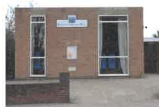
Hartley Village Hall