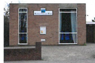
Hartley Village Hall